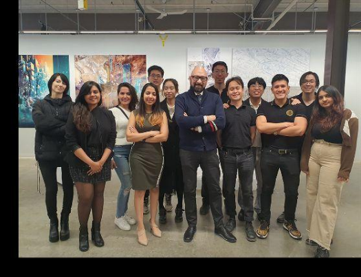
Outcomes: Datasets, Conference, Colloquium, Publications